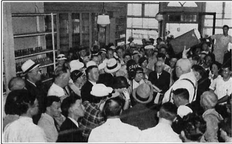
Auction Sale of Leadbeater Pharmacy, Alexandria, Va., July 19, 1933. The sale took place in a room next to the old pharmacy.